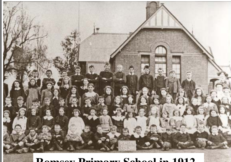
Romsey Primary School in 1912